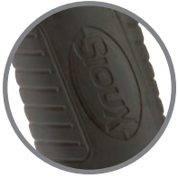
Ergonomic handle with textured soft grip