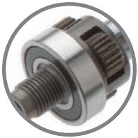
3 Idler gear system for increased life and load capacity