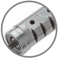
1 HP motor