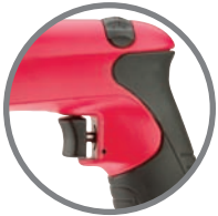
Telescoping throttle, conveniently located reverse