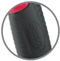
Ergonomic, handle with soft textured grip