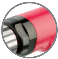
Light weight aluminum housing