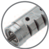
Available in 1 HP and .6HP motor