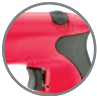
Teasing throttle, conveniently located reverse