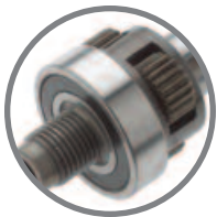
3 planet gear system for increased life and load capacity