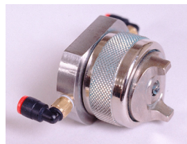
The A7A air-assisted airless module can be installed in seconds.

The Nordson A7A air-assisted airless module is designed for use with Nordson's Cross-Cut® nozzles. Cross-Cut nozzles have set the industry standard